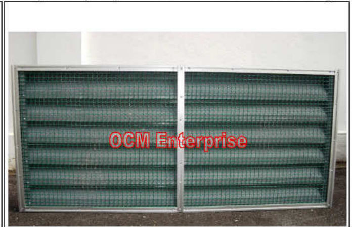
Composite (FRP) Louvers Window & Alu Netting TNB Sub Station Signage