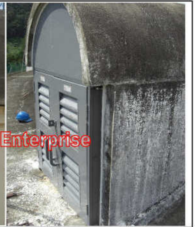
Composite(FRP) Door for Dam